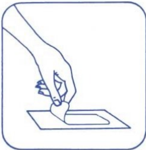
Wrong way to remove label from liner.

The best way to separate a label from the liner is to actually remove the liner from the label. When hand applying labels you will be much more successful if you handle the label at the middle of its longest side. This allows all four corners to have the best chance to fully adhere to the final product.